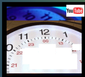
Automatic Military Clock Drawing Test en español