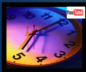
Automatic Clock Drawing Test en español

SpecialtyAutomated was recently recognized as a prestigious South Florida Business Journal 2008 Technology Award Finalist for Internet-Based Technologies. Other finalists included computer giant, Hewlett-Packard. Awards were presented at the Seminole Hard Rock Café and Casino in Hollywood, Florida.