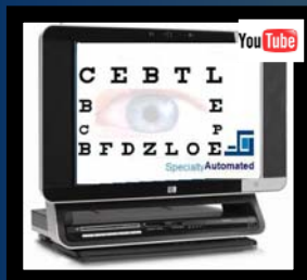
Automatic Dynamic Visual Acuity Test en español