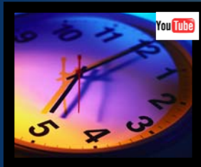
Automatic Clock Drawing Test en español

SpecialtyAutomated was recently recognized as a prestigious South Florida Business Journal 2008 Technology Award Finalist for Internet-Based Technologies. Other finalists included computer giant, Hewlett-Packard. Awards were presented at the Seminole Hard Rock Café and Casino in Hollywood, Florida.