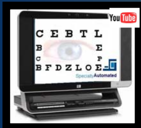
Automatic Dynamic Visual Acuity Test en español